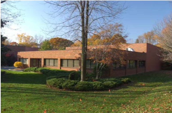
This is a representation of the buildings at CBP and may not be the building listed above.